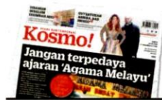
KERATAN Kosmo! 30 Januari 2021.

"Jakim menerima laporan berhubung kes ini pada minggu lalu selepas satu video upacara ritual berkaitan ajaran itu tular di media sosial," katanya.