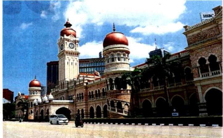
Iconic landmark: A general view of the Sultan Abdul Samad Building in the heart of Kuala Lumpur.