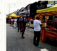
Traders who rely solely on night market visitors to make a living, the two-week closure has been a tough time for them.