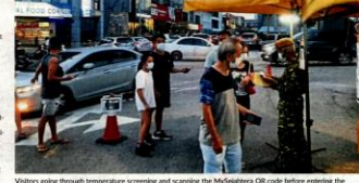
Visitors going through temperature screening and scanning the MySajatera QR code before entering the Taman Midah night market in Cheras.