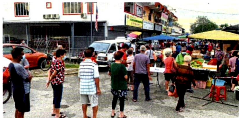
Shoppers lining up to enter the Lorong Sepat morning market in Klang.

The reopening of the remaining two daily markets and two weekly markets in the municipality, said