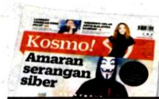
KERATAN Kosmo! 27 Januari 2021.

naik kumpulan itu, mereka berjanji untuk mengadakan serangan siber terhadap laman web kerajaan dan aset atas talian