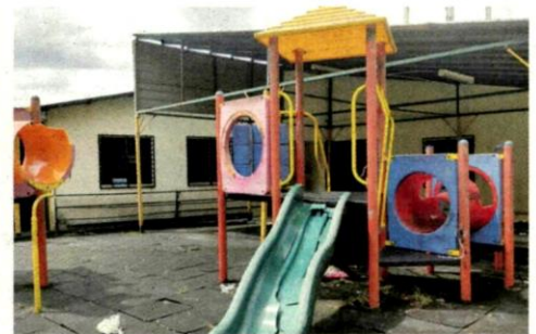
Taman permainan rosak akibat tidak diselenggara oleh pihak pengurusan.

rakan pernah bekerjasama untuk membersihkan kawasan di bloknya dengan upah sebanyak RM10 setiap rumah, namun golongan tersebut tidak mahu memberi kerjasama.