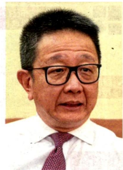
Teng urges registered businesses to take advantage of the state government's initiative.

Teng also said the state government remained committed to the digitalisation agenda in assisting