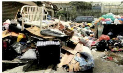
Longgokan sampah antara blok-blok kediaman yang tidak terurus sehingga mengeluarkan bau busuk.

Selain itu, tinjauan juga mendapati kemudahan lain seperti tangga, kamera litar tertutup (CCTV) dan taman permainan rosak akibat tiada penyelenggaraan baik daripada