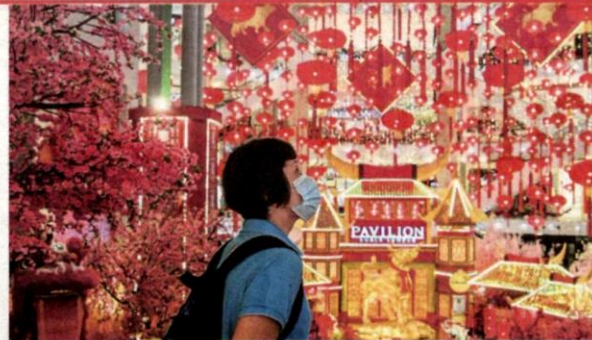
A shopper admiring Chinese New Year themed decorations at a shopping mall in Kuala Lumpur.

the Investment Standing Committee, Industry and Commerce and Small and Medium Enterprises (SME) portfolio.