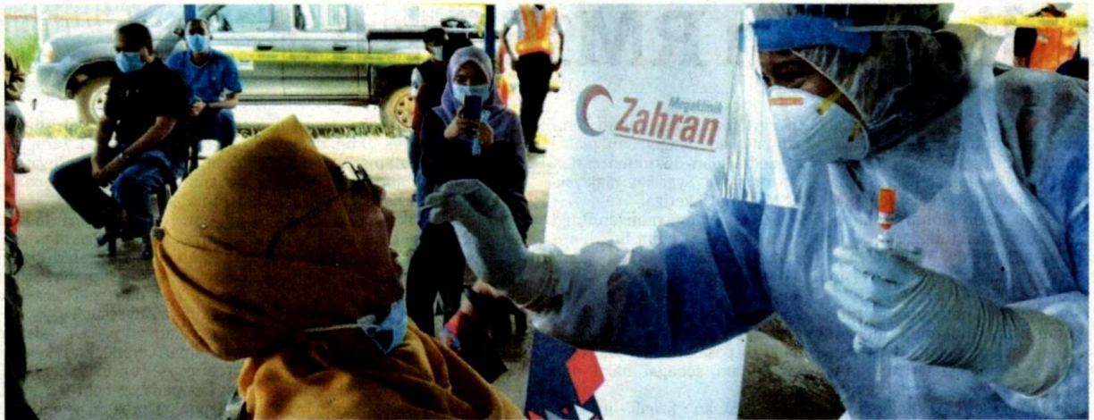
KAKITANGAN Megaklinik Zahran melakukan ujian saringan terhadap seorang individu di cawangan Johor Bahru, Johor, baru-baru ini.