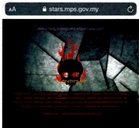
LOGO cyberpunk yang didakwa ditinggalkan di laman web MPS disyaki dilakukan oleh Anonymous Malaysia sebelum ia dibalk pulih.

bersifat misteri kerana tidak memberikan pautan URL dan memerlukan pengendali sistem mencari sendiri kesilapan," ujarnya.