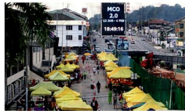
A barrier is placed in the middle of the road at the Jalan Tasek night market in Klang to ensure one-way flow of people.